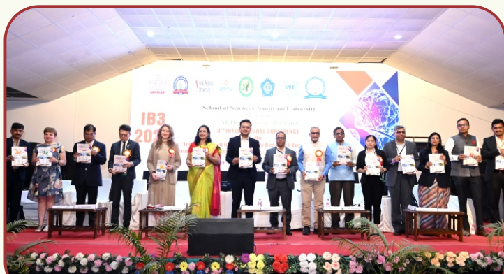
Dignitaries releasing the research paper souvenir during the conference inauguration at Sanjivani University.