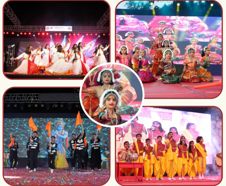
Child artists performing during the Annual Gathering of Sanjivani Academy's Secondary Section.